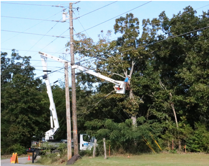
Dusty Jones, LREC right-of-way

Trees beautify our communities, provide habitat for wildlife, offer shade, and help keep our environment clean. But, trees that grow too close or into LREC’s power lines can result in power outages and pose a safety risk. That is why LREC operates a vegetation management program that keeps our power lines clear of trees and ensures the following.